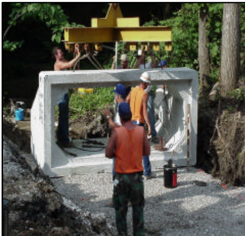
Setting 4'X10' Precast End Section

The contractor for this project is Emery Sapp and Sons Columbia, Mo.