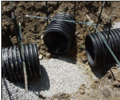
24" Drainage pipe catch basin location