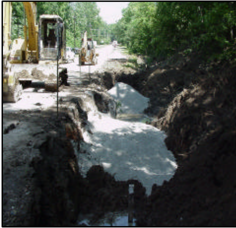
Relocation of 12" Water Main