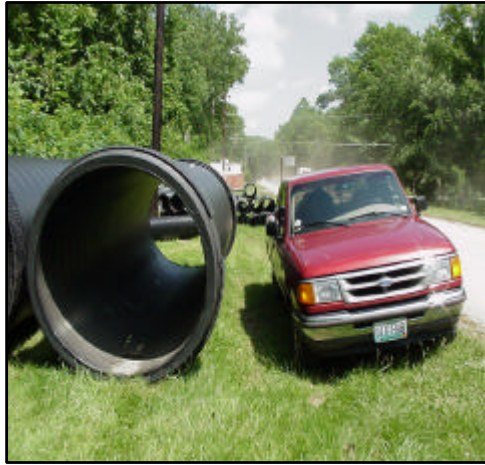
60" HDPE Storm Drainage pipe