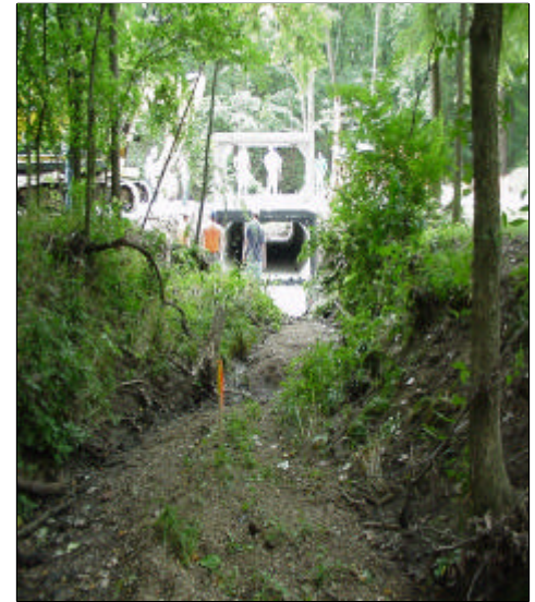
Setting Precast Culvert Sections