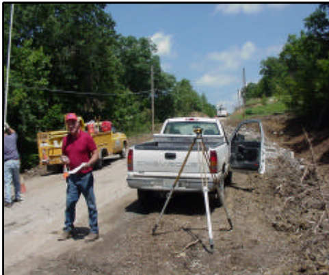
Check Grade and Alignment