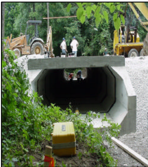
Finishing up the precast culvert

This copy of the VISIONS features a recently completed road drainage project for MOBERLY, MO We thought you would like to take a look