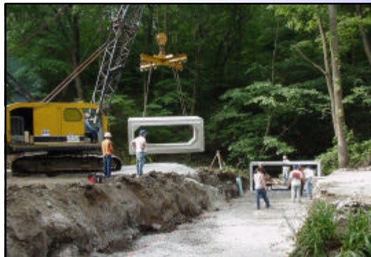
Setting the culvert on a prepared base

This copy of the VISIONS features a recently completed road drainage project for MOBERLY, MO We thought you would like to take a look