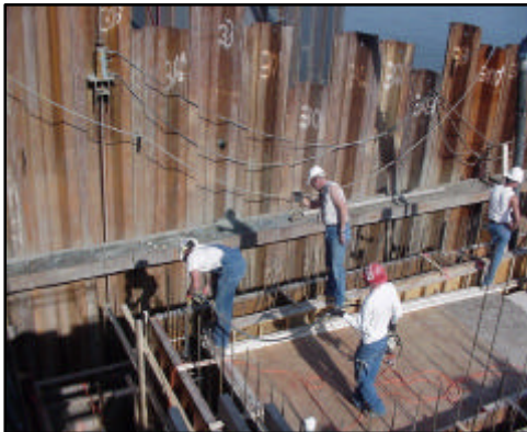
Major pour in the first lift of the wall