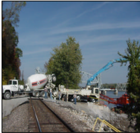
Sitting on the RR tracks