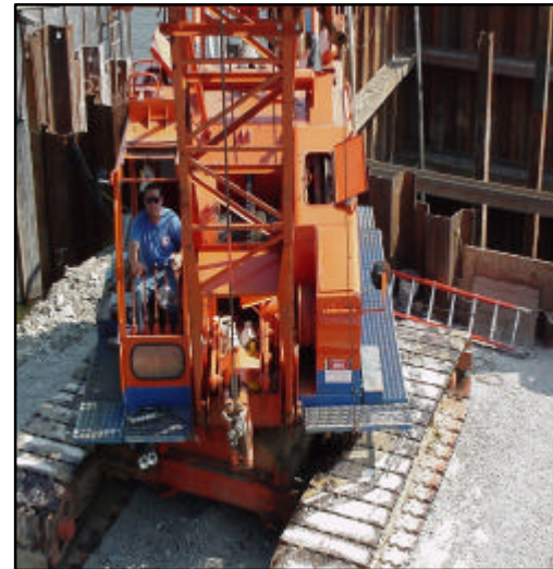
Moving items in and out of coffer dam