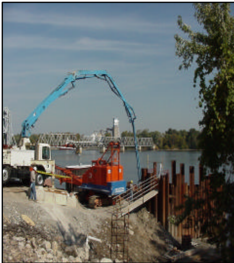
Pumping concrete into coffer dam

This copy of the VISIONS features the construction activities recently completed for