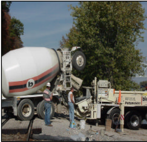
165 cu. yards in the base slab