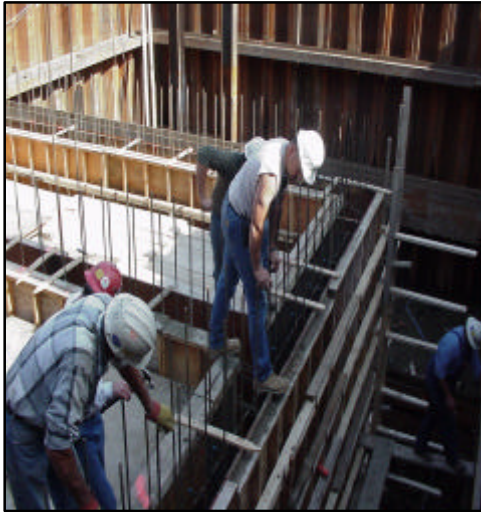
Steel reinforcing 18" walls