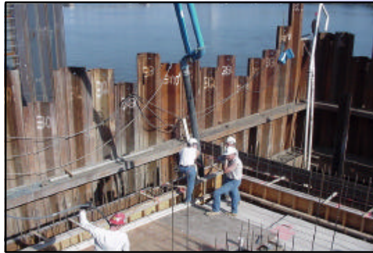
Inside the coffer dam Mississippi River

We thought you would like to take a look.