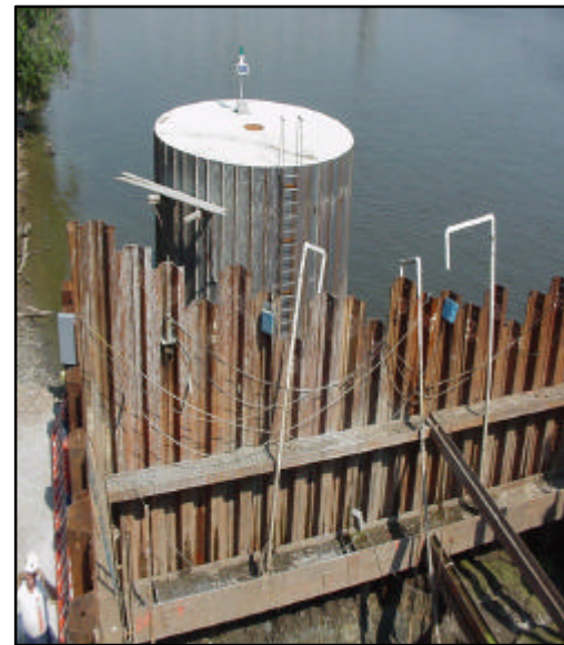
Intake Protection Cell